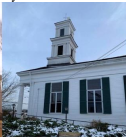
Mt Carmel UCC