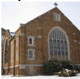
Hamden Plains Methodist