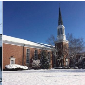
Spring Glen UCC